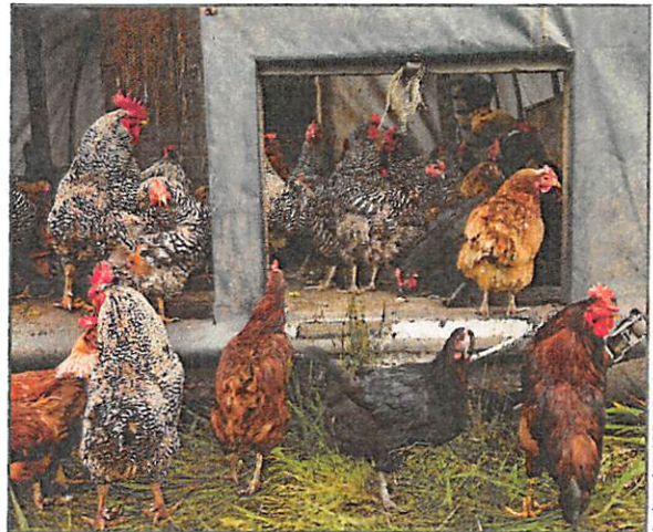
Artbandito (CC BY-NC-ND 2.0)

Grading eggs: Texas A&M Poultry Science Center, 979-845-4319. USDA Egg-Grading Manual, https://www.ams.usda.gov/grades-standards/shell-egg-grades-and-standards